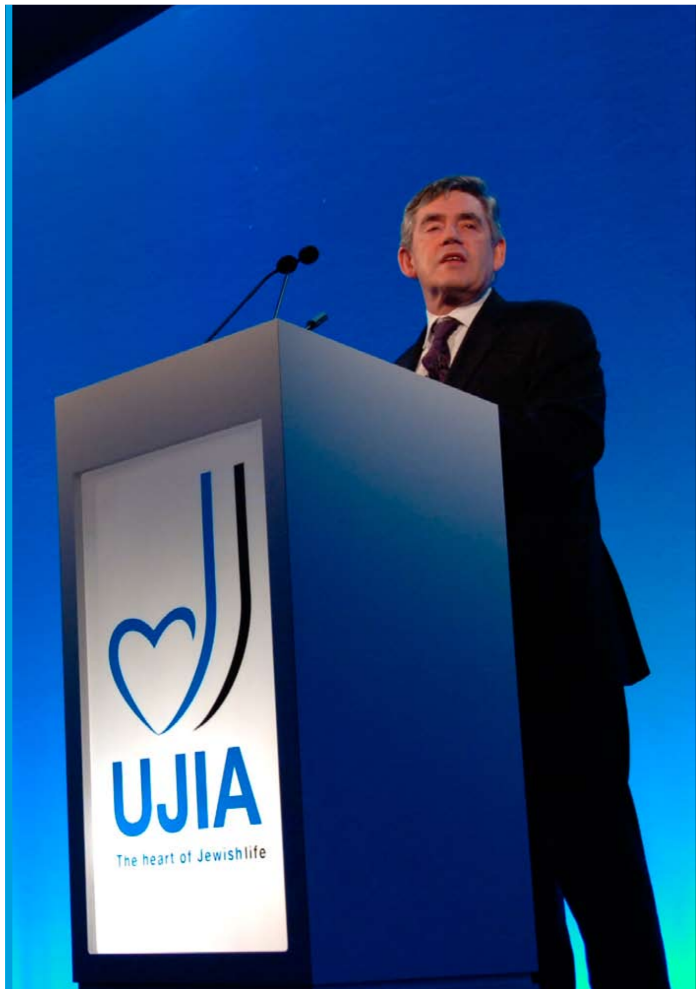
PM Gordon Brown addresses the UJIA Annual Dinner in September 2008